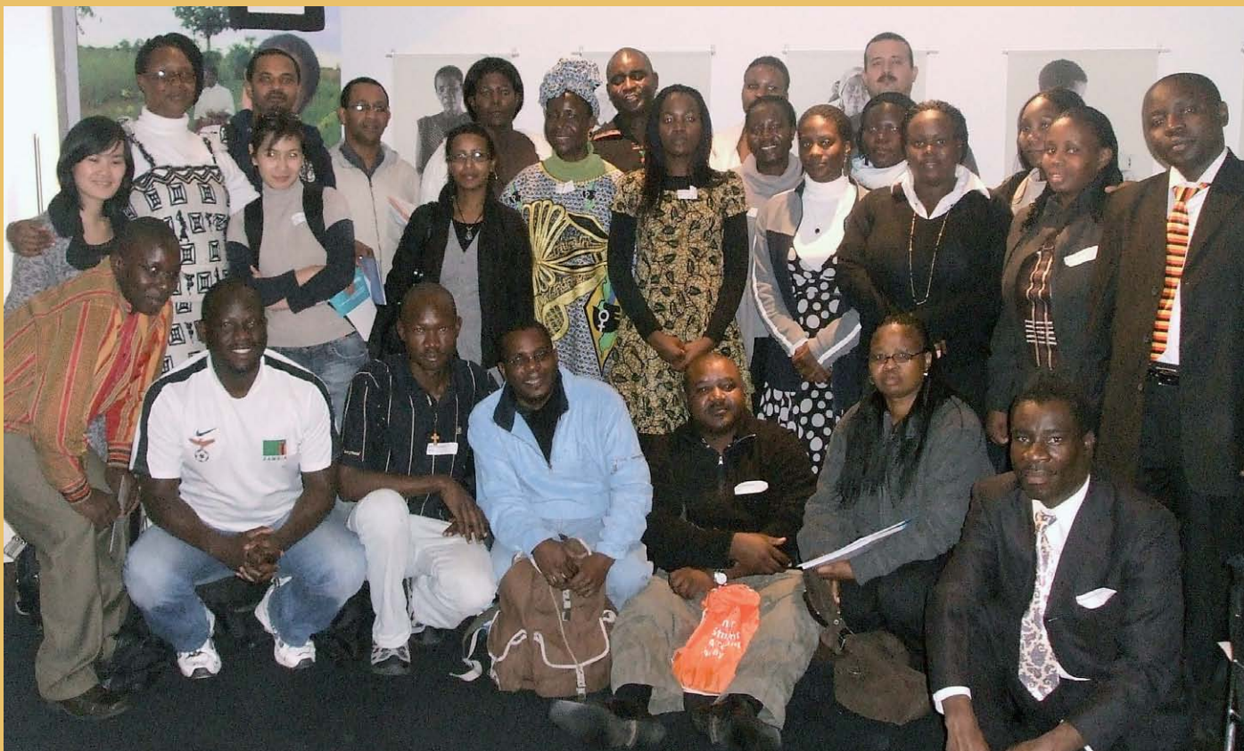
New Ireland-based Study Fellows at the 2010 orientation

Goal: To work with Irish Aid and higher education institutions to develop the Fellowship Training Programme as an effective tool for capacity development in Ireland's partner countries and to contribute to a better understanding of the programme in Ireland