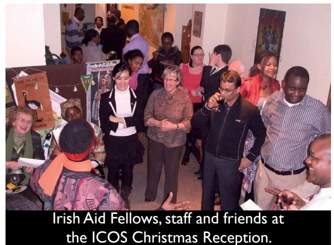
Irish Aid Fellows, staff and friends at the ICOS Christmas Reception.